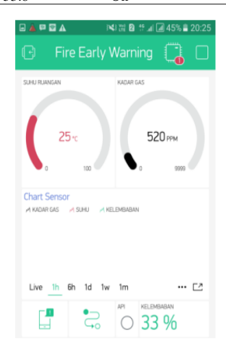
Figure 3. Temperature Sensor Testing