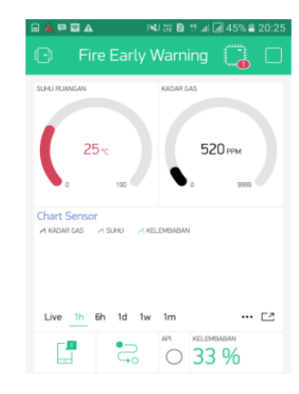
Figure 5. Sensor Monitoring Display on Android Smartphone

The Blynk application on this system is used to display information regarding temperature, humidity, gas levels and provide notifications on Android-based cellular phones when gas or fire is detected. The programming code that is installed into the microcontroller to activate this application is shown in Figure 5.