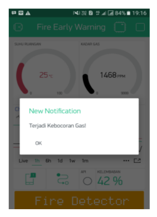
Figure 5. Gas Leak Notification