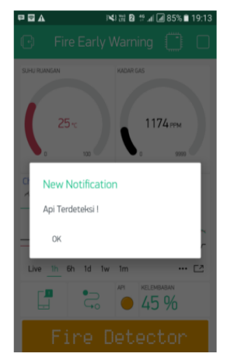
Figure 4. Notification of a Fire Occurrence