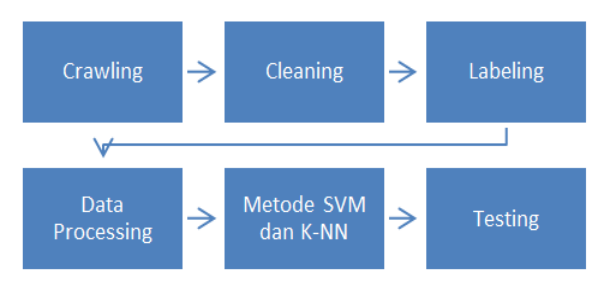
Figure 2. Flow of Research Stages

The stages in the research can be seen in Figure 2.