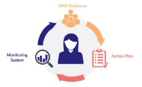
Figure 1. Regional Disaster Management Agency

and effective [19]. In the event of a disaster, BPBD Kota Medan provides assistance and protection to those affected by evacuating, providing medical care, equipment, and other forms of aid [20]. BPBD Kota Medan evaluates the damage caused by disasters and initiates recovery efforts, including rebuilding damaged infrastructure and providing support to affected communities [21]. By fulfilling these roles effectively, BPBD Kota Medan can minimize the damage caused by disasters and ensure a more efficient response to emergencies.