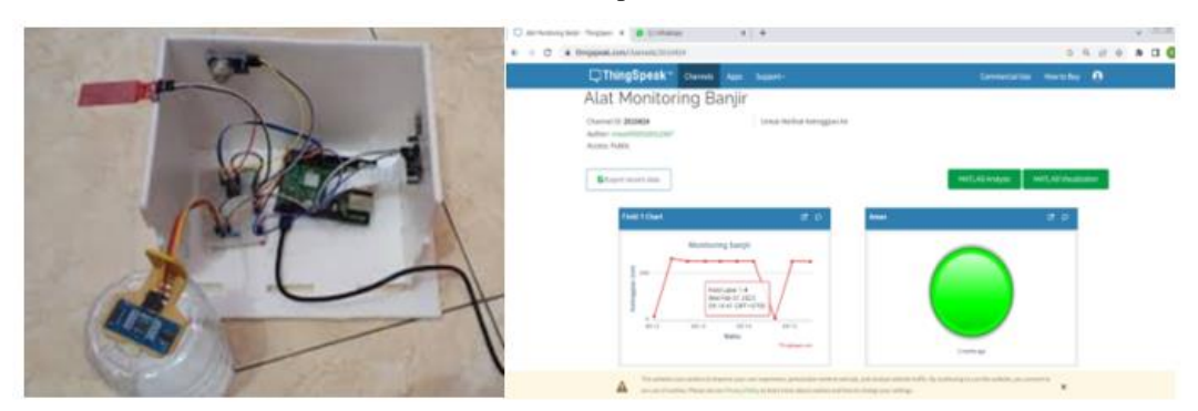
Figure 3. IoT-Enabled Flood Monitoring Prototype Utilizing ESP-8266, Connected to ThingSpeak Server, and Simulating Flood Conditions

ThingSpeak platform is effective, enabling floodrelated monitoring and data collection. The ESP-8266 acts as the main component on the hardware side, managing data collection from the sensors and forwarding it to the ThingSpeak server. This demonstrates the reliability of the hardware in generating accurate data and connecting it to the online platform.