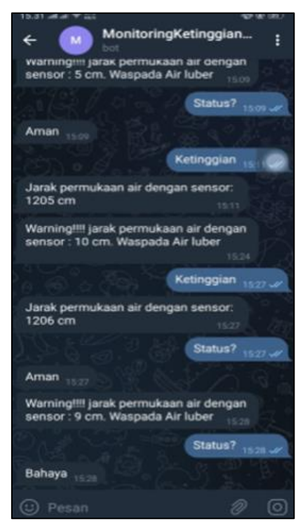
Figure 4. Feedback telegram for water level

The simulation of flood conditions on the ThingSpeak server highlighted the system's ability to simulate and process data related to water levels, rain intensity, and other relevant factors in a flood scenario. This simulation approach is an important contributor to the reliability of the system, enabling in-depth testing independent of unpredictable natural conditions.